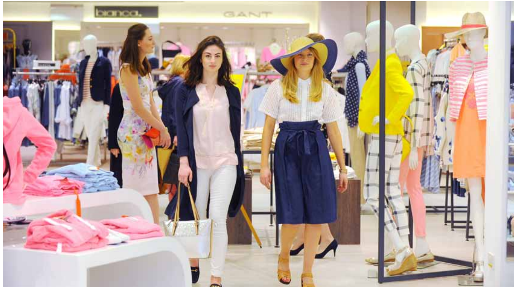
■ Models used the whole store as their catwalk at Jarrold as they showed off outfits from the womenswear collection.