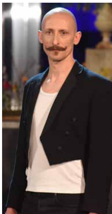
■ Some vintage styles including flamboyant looks for the chaps, from the show at Open.

But the biggest cheer of the evening erupted when male models