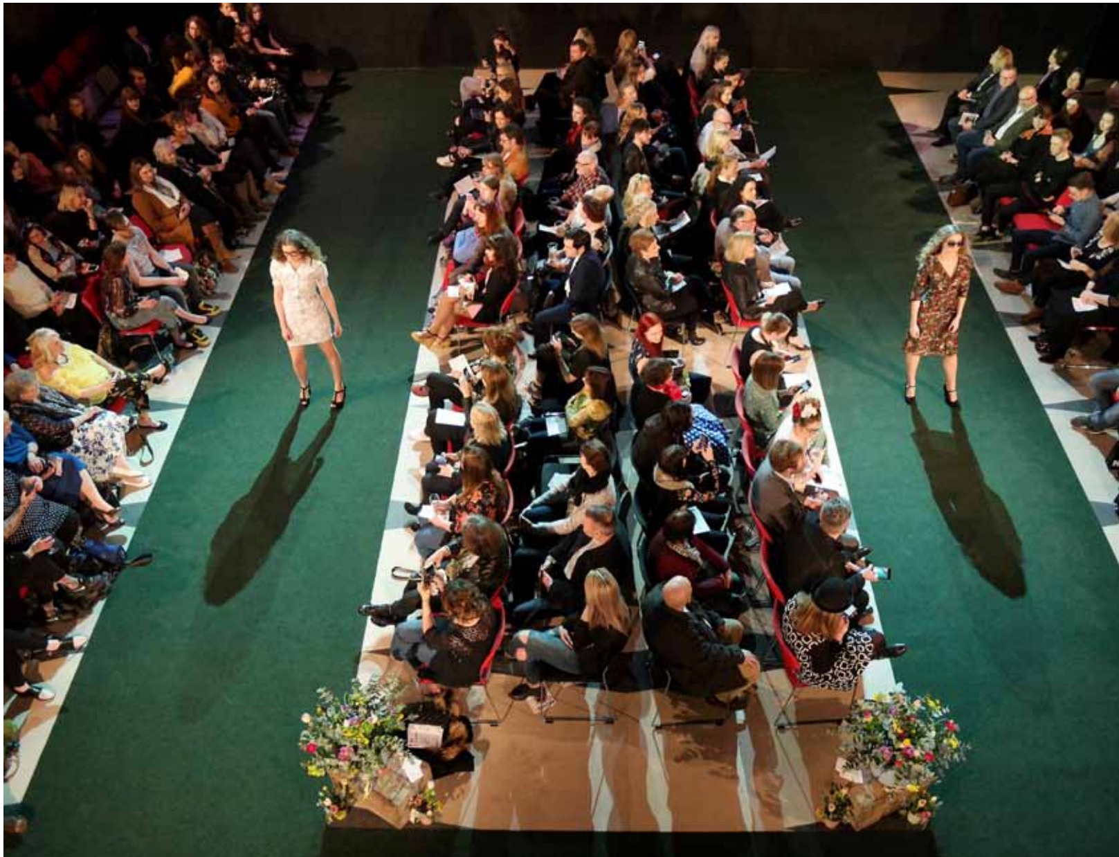
■ The runway was turned into a U-shaped garden for the vintage show and florals featured strongly in the collections.