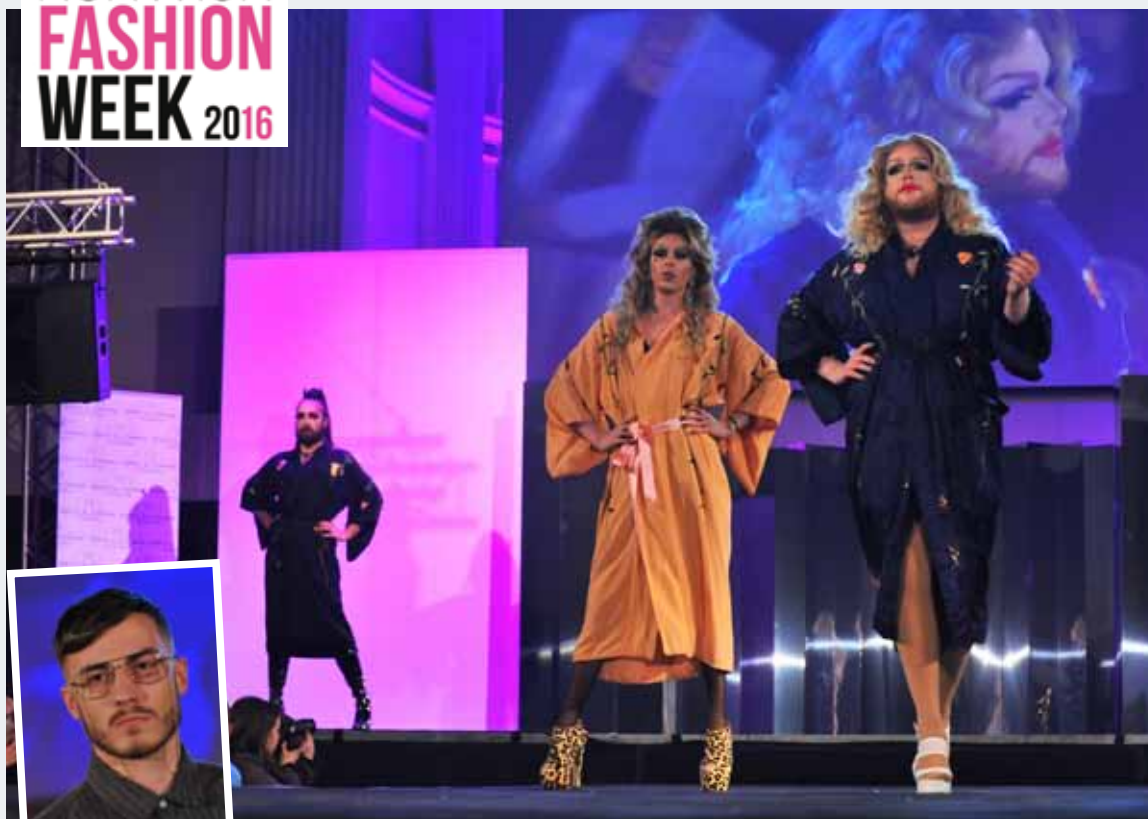
■ Rosebud, a group of glamorous drag queens, stole the show - which featured some dynamic hairstyles and eyewear from Dipple and Conway.